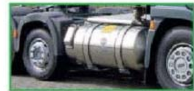
Fuel for Automotive