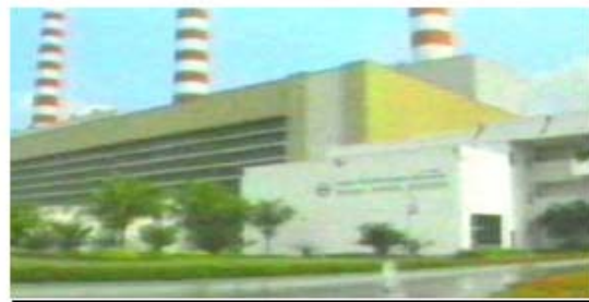
Fuel for Power Generation