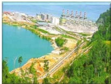
Fuel for Industry