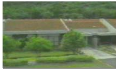
Fuel for Residential