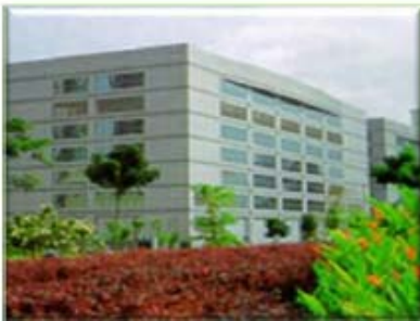
Fuel for Gas District Cooling