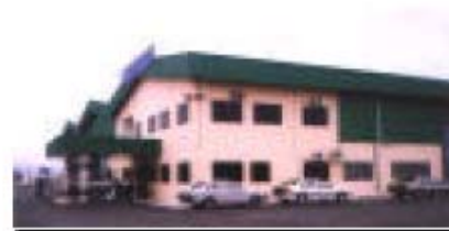
Fuel for Commercial