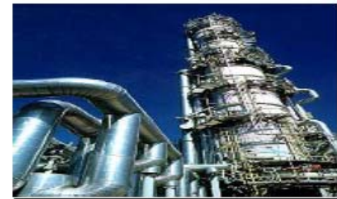
Fuel for Petrochemical Feedstock